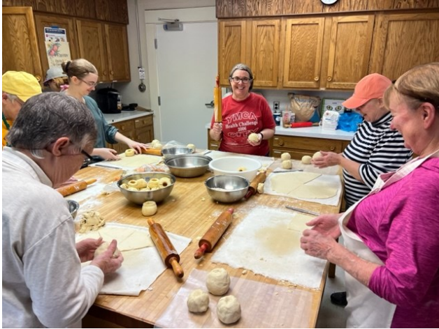
Apple dumpling sales (top, below left) fund spaghetti dinners on the first Tuesday of each month (below right, bottom). Volunteers are seen here at both projects.